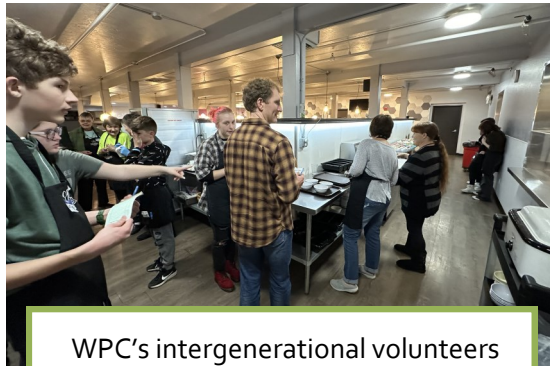
WPC's intergenerational volunteers serve at the Main Ingredient, a community restaurant run by the Medford Gospel Mission