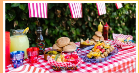
All-Church Picnic September 7