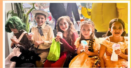
Harvest Party October 19