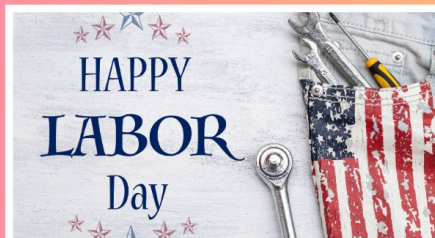
Office Closed September 1