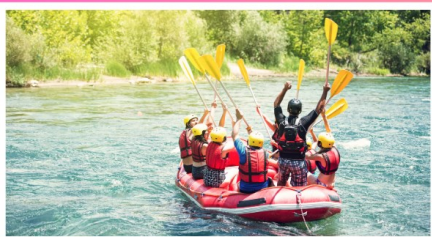
YG Rafting August 10