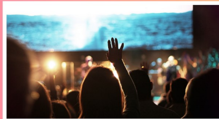
Rogue Valley Youth Group Night of Worship September 7